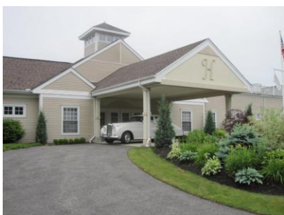
Hillside Country Club 82 Hillside Avenue, Rehoboth, MA www.hillsidecountryclub.com